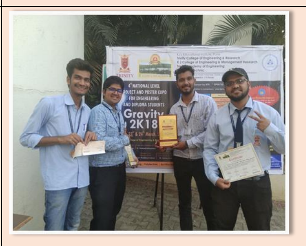
Winners in Project & poster Competition

completed General Course in Intellectual Property by WIPO