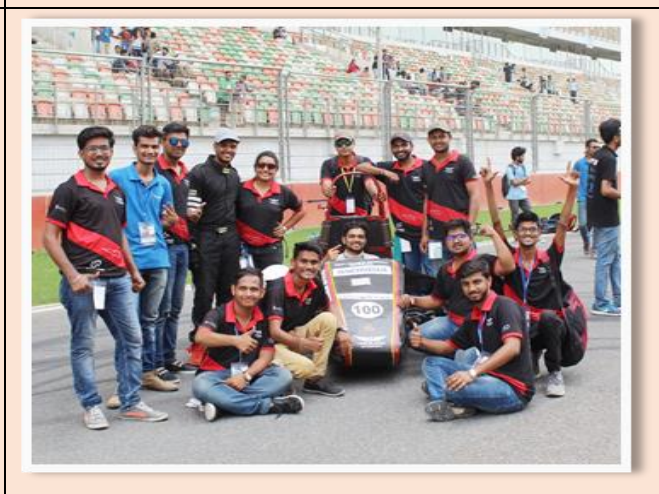
Team Trailblazer, 5th AIR in SAEINDIA SUPRA 2018